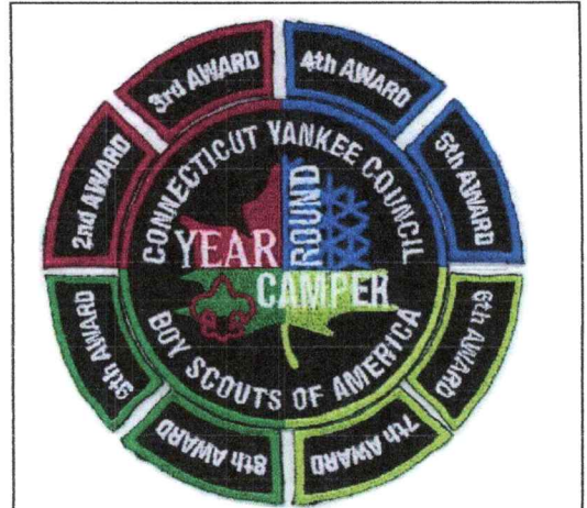
Year-Round Camper Score Card

The "Year-Round Camper" patch may be purchased at the Council Trading Post when the completed score card is presented. The card will remain in the unit advancement records at the Council Office.